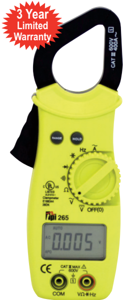
8" x 3"

The P920-265-TPI with slim jaw and body is ideal for cramped work areas and crowded electrical panels.