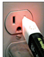
AC Voltage in wall receptacles