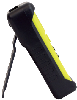
Tilt Stand For The P920-343-tpi

Size: 5.75" x 2.75" x 1.5" 41mm x 152mm x 77mm