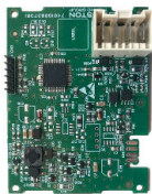
0-10V / 4-20mA Clip-In Module