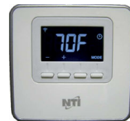
NTI Digital Room Sensor