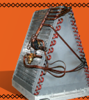
- Uncased Vertical A-Coil CAPVU