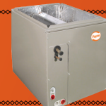
- Cased A-Coils CAPMP (Multi-Poise) CAPVP (Vertical)