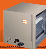
- Cased Horizontal N-Coil CNPHP