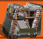
- Uncased Vertical N-Coil CNPVU