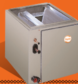
- Cased Vertical N-Coil CNPVP / CNPVT