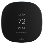
ecobee THERMOSTAT Powered by Bryant

Achieve greater efficiency and whole-home comfort with this Wi-Fi® smart thermostat.