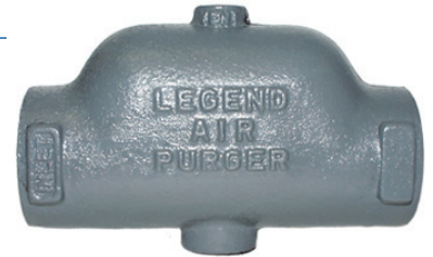
Pictured Model T-80