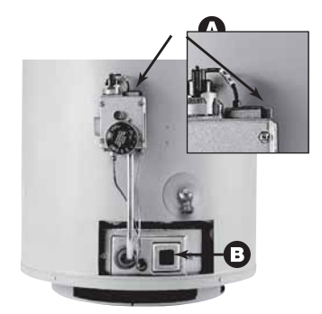
A. Easy-to-light piezo ignitor

B. View port for easy burner inspection inside sealed combustion chamber