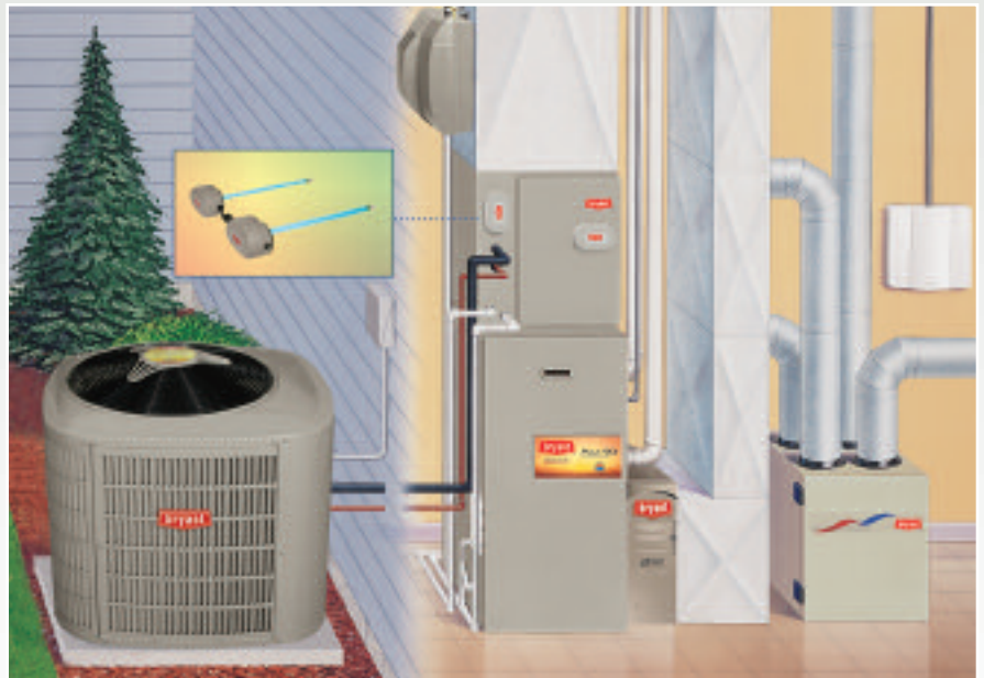
Central Air Conditioner and Gas Furnace System

while maintaining the integrity of your Bryant system. EZ Flex™ is designed by a company that understands the whole system. Other filters are designed by companies that focus on filtration only.