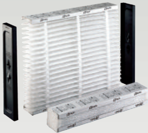
EZ Flex™ Filter