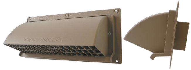
WC31068 - Brown Range Hood