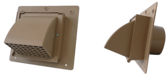
WC4 - Brown