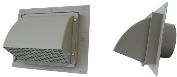
WC631 - Light Grey