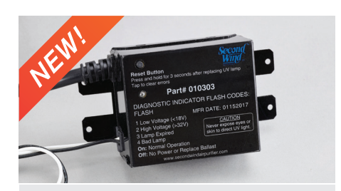
Ballast Diagnostic Information indicates low voltage, high voltage, lamp expired, bad lamp, no power or replace ballast and normal operation.

SECOND WIND AIR PURIFIERS USE ULTRAVIOLET GERMICIDAL LIGHT AND A PATENTED PHOTO-CATALYTIC PROCESS TO DISINFECT MOLD, BACTERIA, INFECTIOUS DISEASE AND DECREASE VOLATILE ORGANIC COMPOUNDS IN YOUR INDOOR ENVIRONMENT.