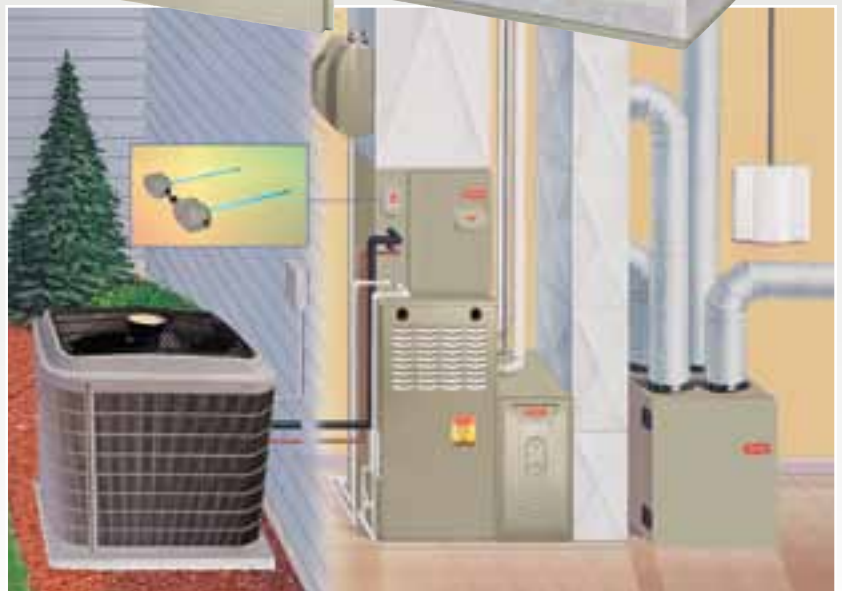
Air Conditioner and Gas Furnace System