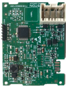
0-10V / 4-20mA Clip-In Module