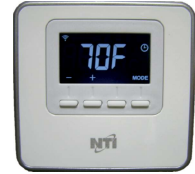
NTI Digital Room Sensor