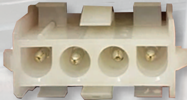
4 Pin Variable Speed

Got an OEM ECM with one of these connectors?