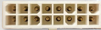
16 Pin Variable Speed